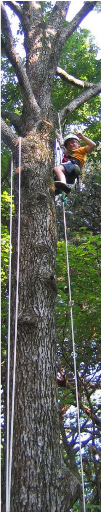
Tate's Tree Climbing program for campers entering 4th-10th grades.